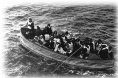
Titanic Survivors.