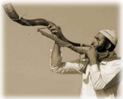
A traditional Shofar being used

There have been many times in our nation's history where all hope seemed lost. Yet from the ashes of almost certain defeat, rally cries have sounded as patriots from unlikely beginnings became the heroes of yesterday.