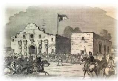
The Battle of the Alamo

The phrase "Remember the Alamo" was born, rallying Texas forces to the cause. A short time later, the Texans completely routed Mexican forces and captured Santa Anna. Emotions were so roused by the Alamo, that the rally cry was used again in the Mexican-American War from 1846 to 1848, and in the Mexican Border War which lasted from 1910 to 1919.