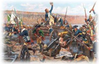
The Battle of Fort Washington

This moment was a memorable moment of sorrow for Thomas Paine, the author of Common Sense , a pamphlet written in 1776. He was busy writing "The American Crisis" while Fort Lee was being evacuated. He wrote the following simple but powerful words, "These are the times that try men's souls"