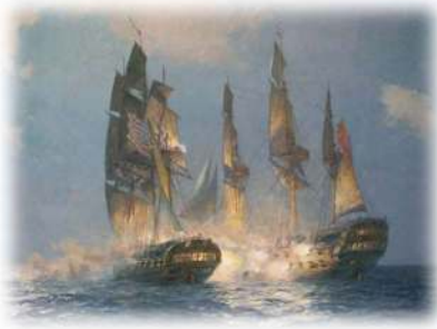
USS Randolph vs. HMS Yarmouth

The USS Randolph was the first frigate built and launched for the American Navy. She had sailed from Charleston and accompanied three other ships from the North Carolina Navy to patrol the West Indies. The frigate was nimble and fast and carried 32 guns to ensure that she had the capability to engage the British.