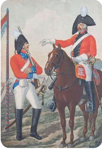
German Dragoon Mounted Infantry

lifetime enlistment, even though he was not yet old enough.