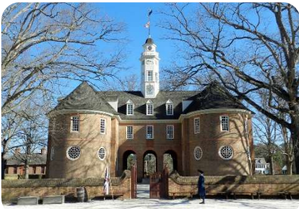
House of Burgesses, Williamsburg, Virginia